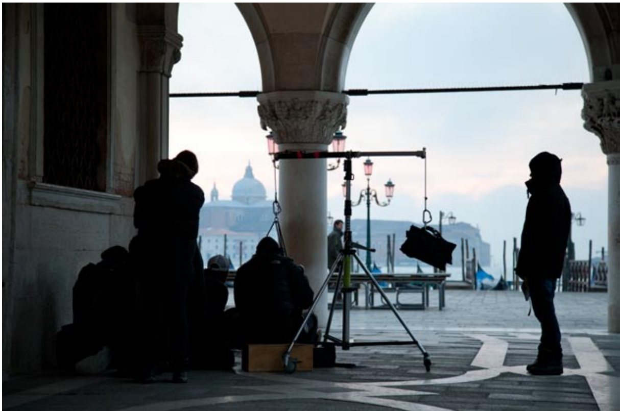
Shooting at dawn in Venice.